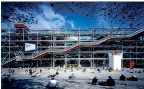
Centre Pompidou, Paris

NEW MEDIAS/ PERFORMANCE Hors Pistes is open for entries for its next PROGRAM www.centrepompidou.fr/horspistes2011