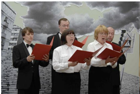
Perestroika-Songspiel de Chto Delat, Hors Pistes 2010