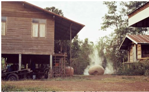
A Letter to Uncle Boonmee, Apichatpong Weerasethakul, Hors Pistes 2010